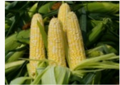
Fresh, sweet corn provided by Samascotts.