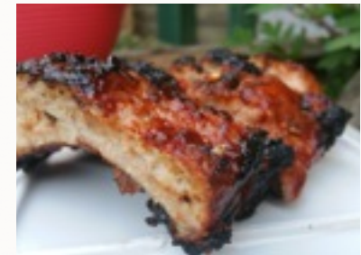
Baby back ribs, dry-rubbed and grilled in classic southern barbecue.