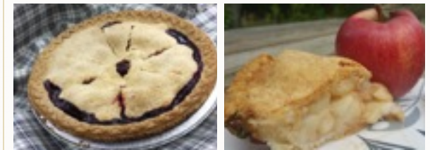
Gather together. Give thanks. Eat pie.